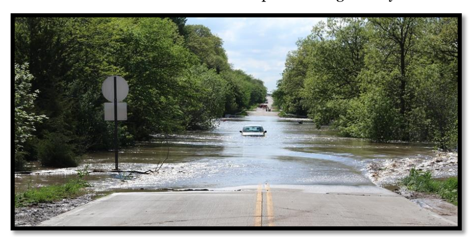
Photo 3. A naïve driver attempts a dangerous crossing through floodwaters.

On the website are links to various smart phone apps, website resources, and federal agency resources for alert information. Floodplain managers may find these helpful as well.