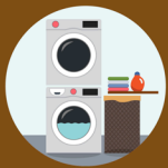
Clothing Washers and Dryers

Basement items are covered under Contents Coverage if they are connected to a power source. Examples include: