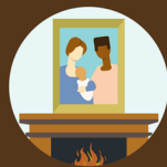
Family Photographs or Keepsakes