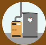
Furnaces and Hot Water Heaters