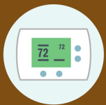
Central Air Conditioners

Basement items are covered under Building Coverage if they are connected to power and installed. Examples include: