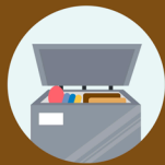
Freezers and Contents