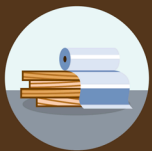
Finished Basement Home Improvements

Items not specifically listed in the policy are not covered in a basement. Examples include: