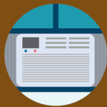
Window Air Conditioners