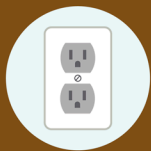
Electrical Outlets and Light Switches