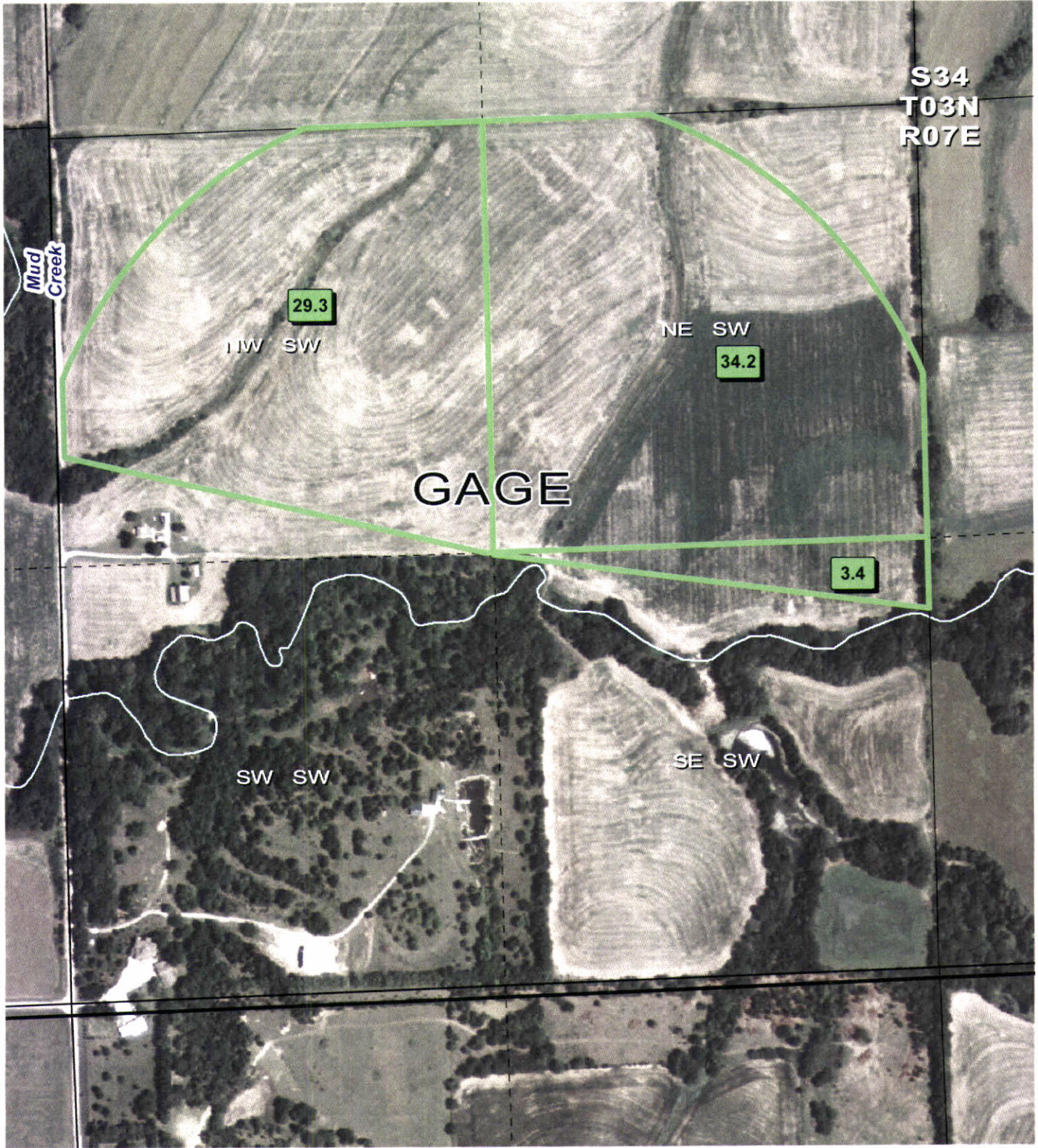
2012 aerial photography