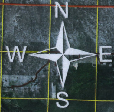
Map of Keith-Lincoln Irrigation Canal and Acres Associated with it