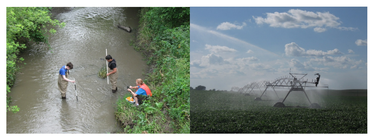
Lower Platte River Basin Coalition Plan –