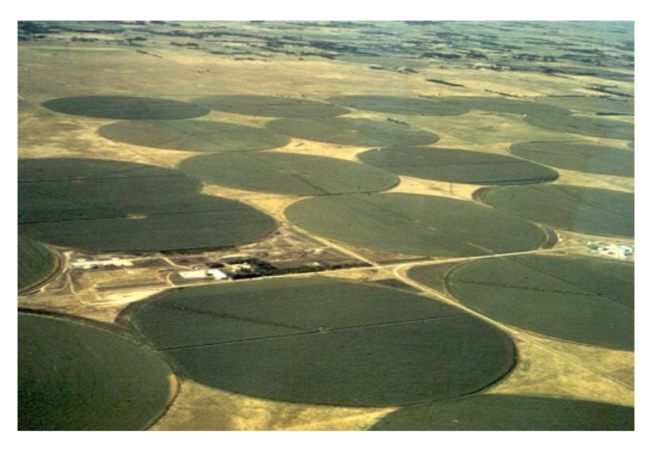
Goal 2: Increase surface and ground water retention by a target amount of 85,000 acre-feet of water annually within the project area reservoirs, groundwater tables and streams.

Difficulties: The success of fully achieving this goal is directly related to the percentage of enrollment. It would likely be met if all the possible acres were enrolled. The $50,000 payment limit per entity can be problematic for reenrollment. There are no incentive payments for re-enrollments. The payment cap also can be a deterrent for new sign-up because PIP has been interpreted as an annual rental payment, subject to the $50,000 cap. Other programs that offer more flexibility such as dryland farming or incentivized reduction in application of irrigation water can appear more attractive to some producers.