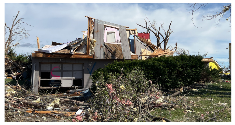
A home in western Dodge County was destroyed the afternoon of April 26, 2024, when an EF-4 tornado developed in southwestern Dodge County and traversed northeast all the way past Blair, NE, finally dissipating near Modale, IA.